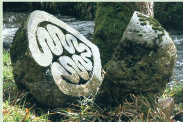
Peter Randall-Page sculpture

D ARTMOOR NATIONAL PARK is one of the few truly wild and natural areas left in Britain. Over 200 square miles of beautiful moorland peppered with historical sites, such as Grimspound dating from about 1500 BC, and dramatic tors, presenting challenging terrain for the adventurous. A myriad of footpaths through spectacular scenery can also be explored by those simply wanting an enjoyable ramble.