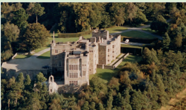
Castle Drogo

T HE RIVER TEIGN runs through Chagford. Fingle Bridge, a favourite beauty spot, can be reached by an enchanting riverside walk where, if you're lucky, you will see salmon leaping.