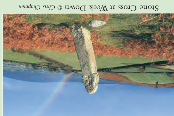
Stone Cross at Week Down

S PECIAL EVENTS Chagford Show - 3rd Thursday August Two Hills Race - Late May Bank Holiday Arts Festival - Alternate summers in July Check out our website for services and local events. www.chagford-parish.co.uk www.dartmoor-npa.gov.uk