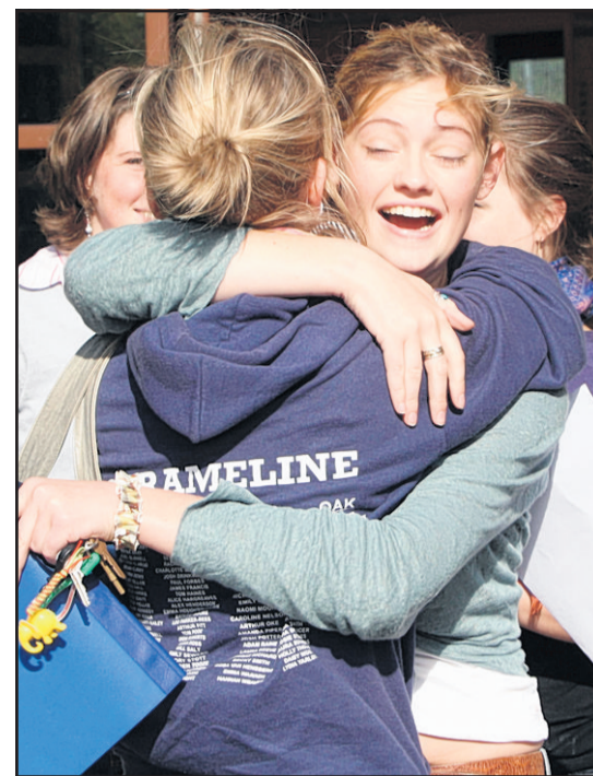
Colyton pupils celebrate excellent grades

Exeter Junior School was named the best independent prep school in the region and 35th best in the country.